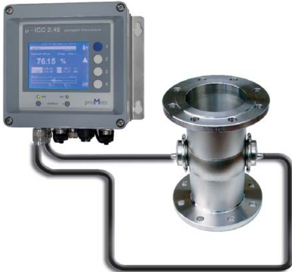
Picture: \mu -ICC-compact with Inline-Measuring-Pipe One-Channel-System for mounting near the measuring point.

It is also possible to use a four-channel-system with separate module-boxes for each measuring point.